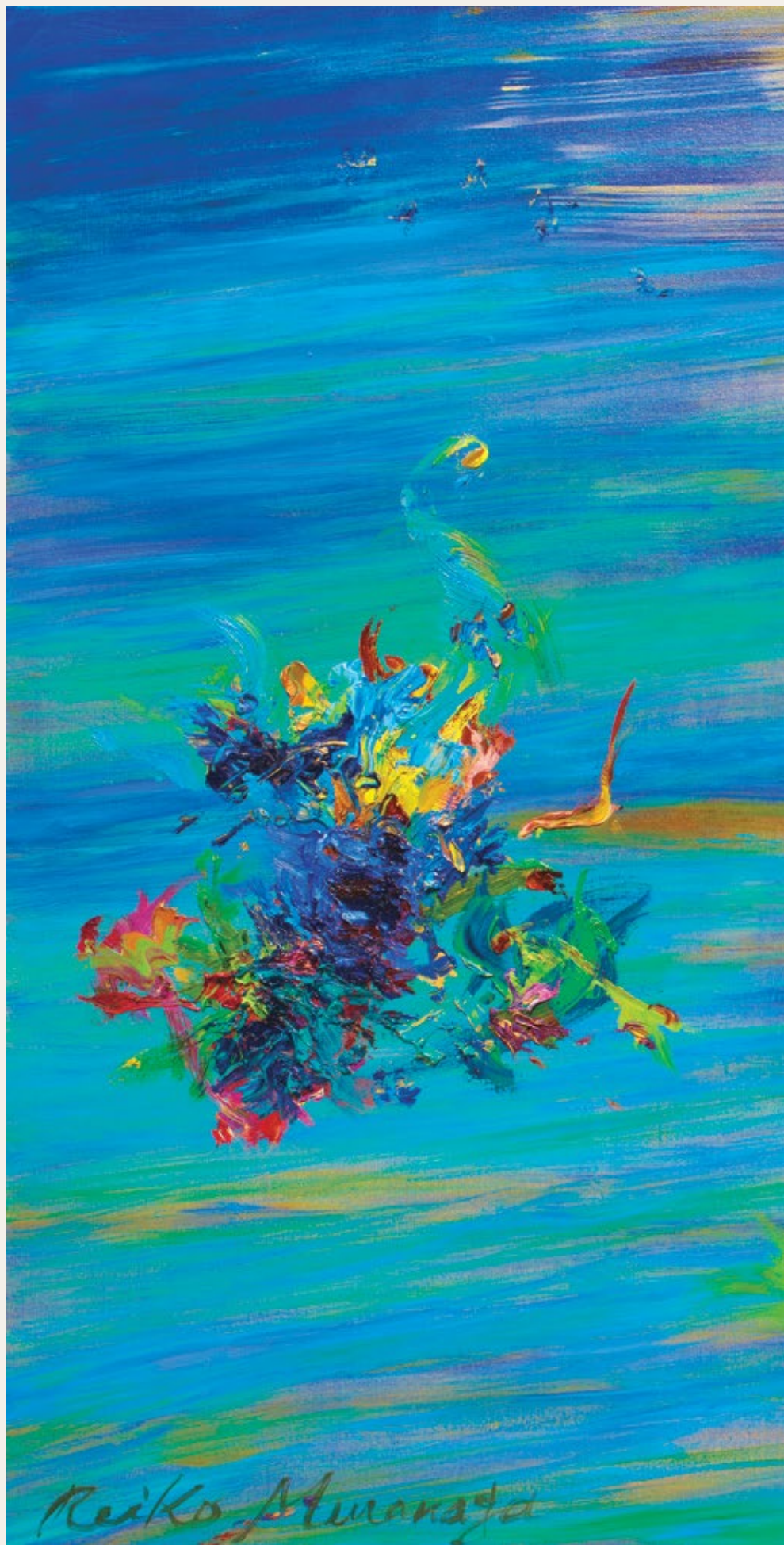
Letter to Monet Page 200-Michikusa